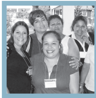
Hispanic Women's Retreat

The PSWC partners with CHET, an affiliate of North Park University and Theological Seminary located in Compton, CA. CHET's mission to equip Spanish speaking men and women for pastoral and lay ministry supports the PSWC's intentional expansion of ministries to serve the rapidly growing Latino population in this region. Learn more at www.chet.org