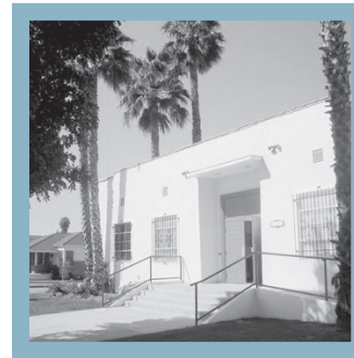
CHET's New Home