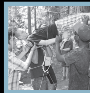
Campers at Alpine