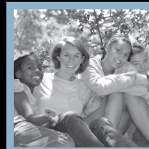
Campers at Mission Springs