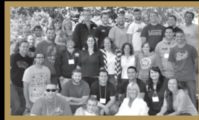
Youth Leaders' Retreat at Mission Springs

The PSWC through its Ministerial Association, team of Spiritual Directors, and staff seeks to encourage pastors and staff ministers to be proactive in self-care and lifelong learning. In May 2011, the total number in the PSWC pastoral community was 437, including those who are currently inactive or retired.